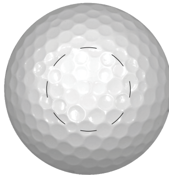
7/8" Diameter Actual Size